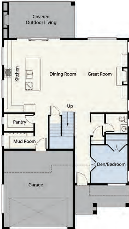
Opt. 3/4 Bath